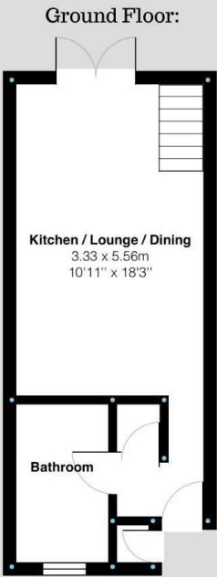
Hawthorne Aveune, Hathern Internal Square Footage: 248 sq.ft