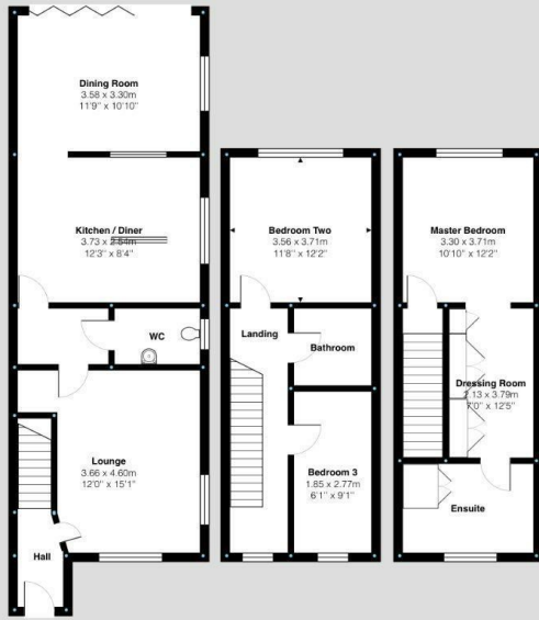
Ground Floor First Floor Second Floor

Adam Dale, Loughborough Internal Square Footage: Approx 1100 sq.ft