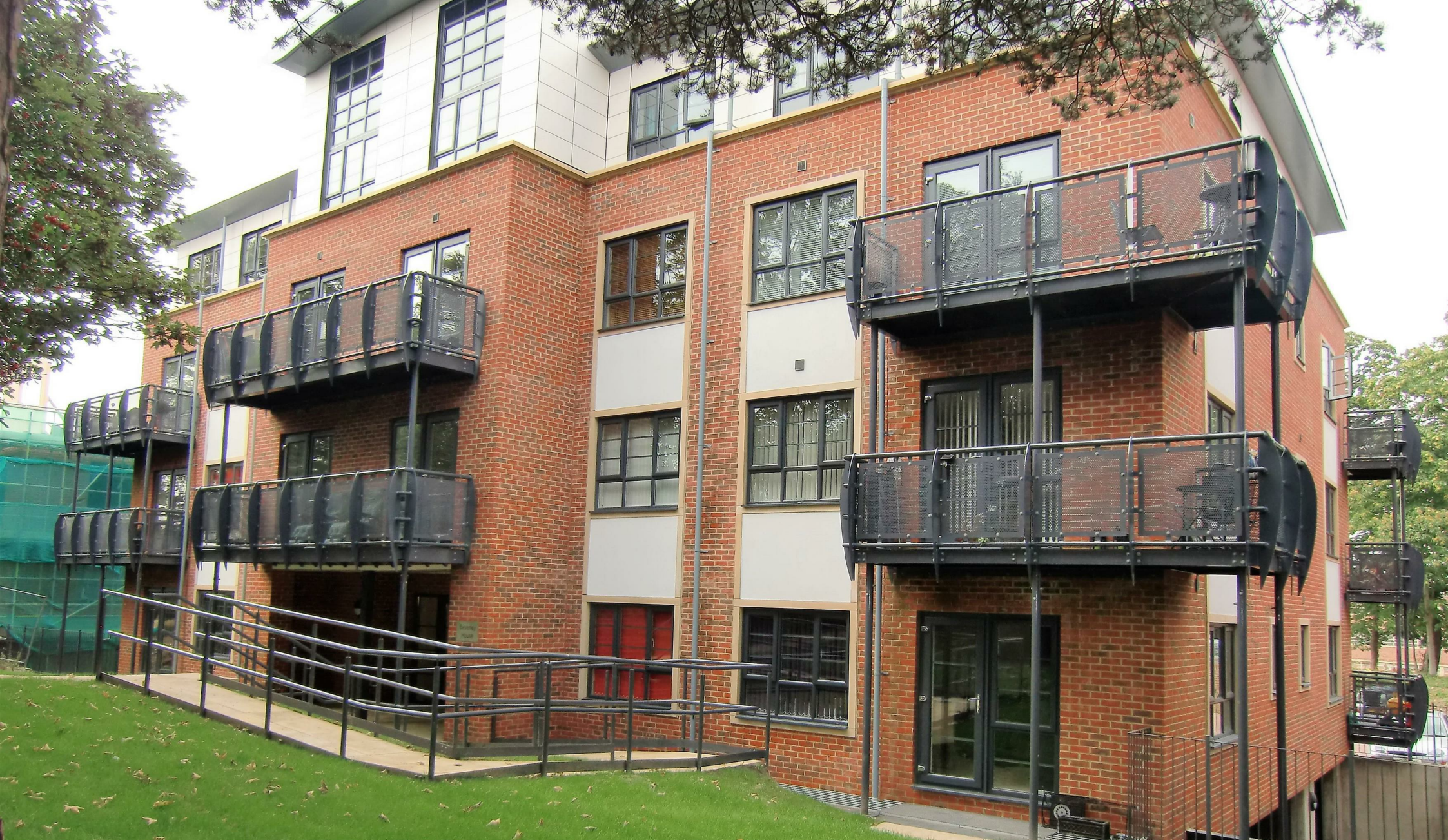
Beverley House, Wallis Square, Farnborough