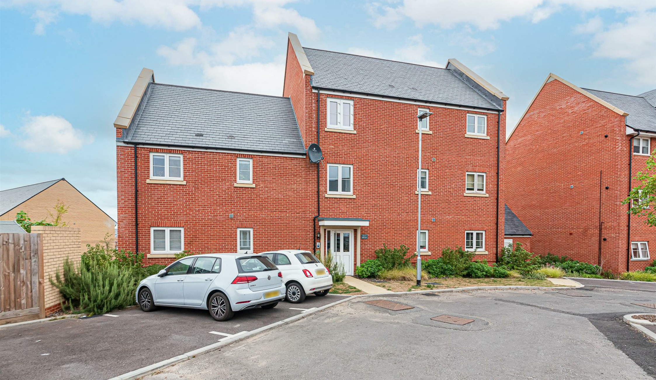
5 Pullen House St Sebastians Way, Wellesley, Aldershot