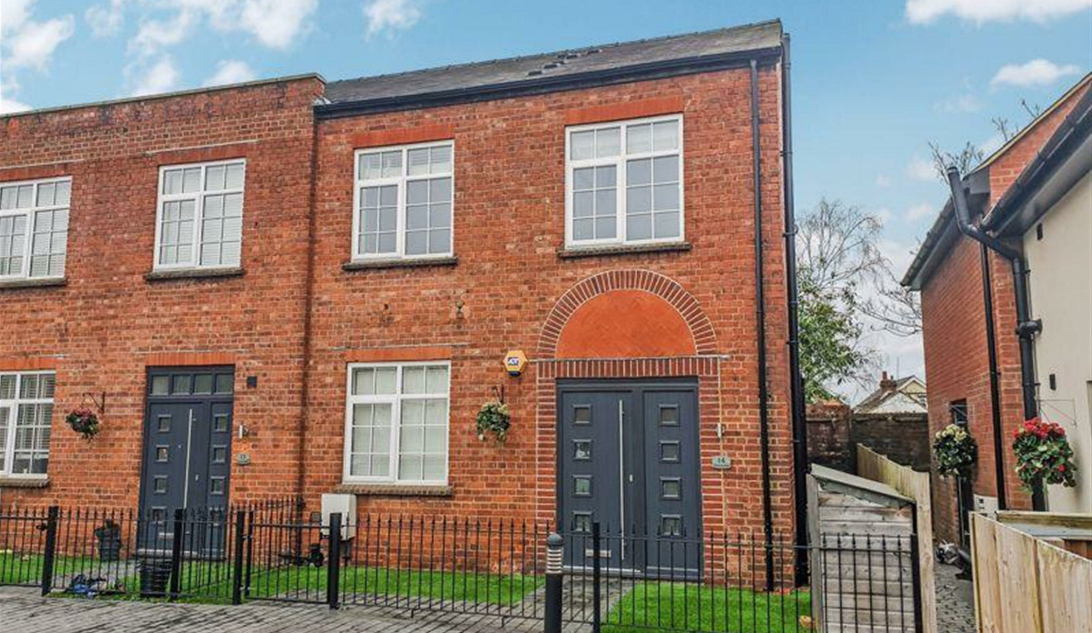
14 Charlie Mews Alexandra Road, Farnborough