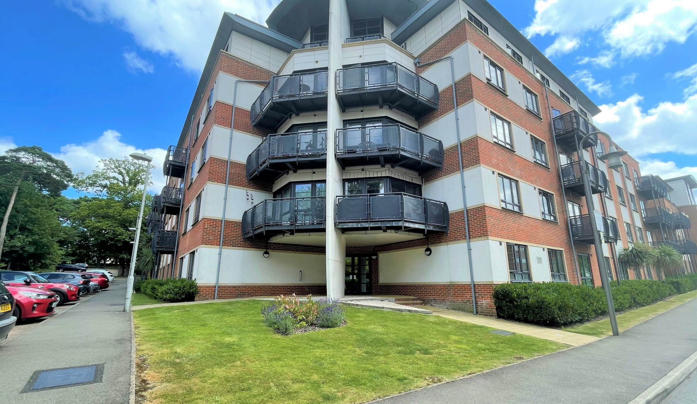
Buccaneer Court, Kestrel Road, Farnborough