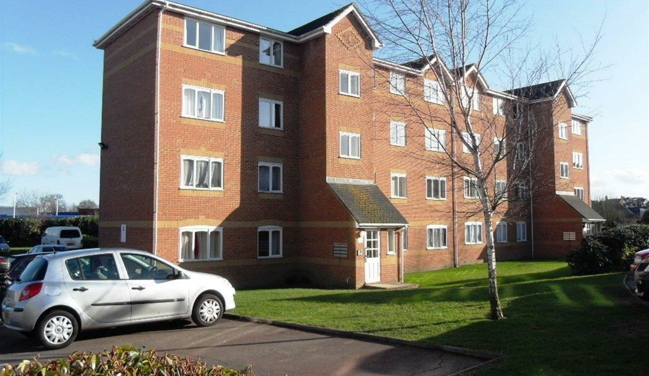
Ascot Court, Grove Road