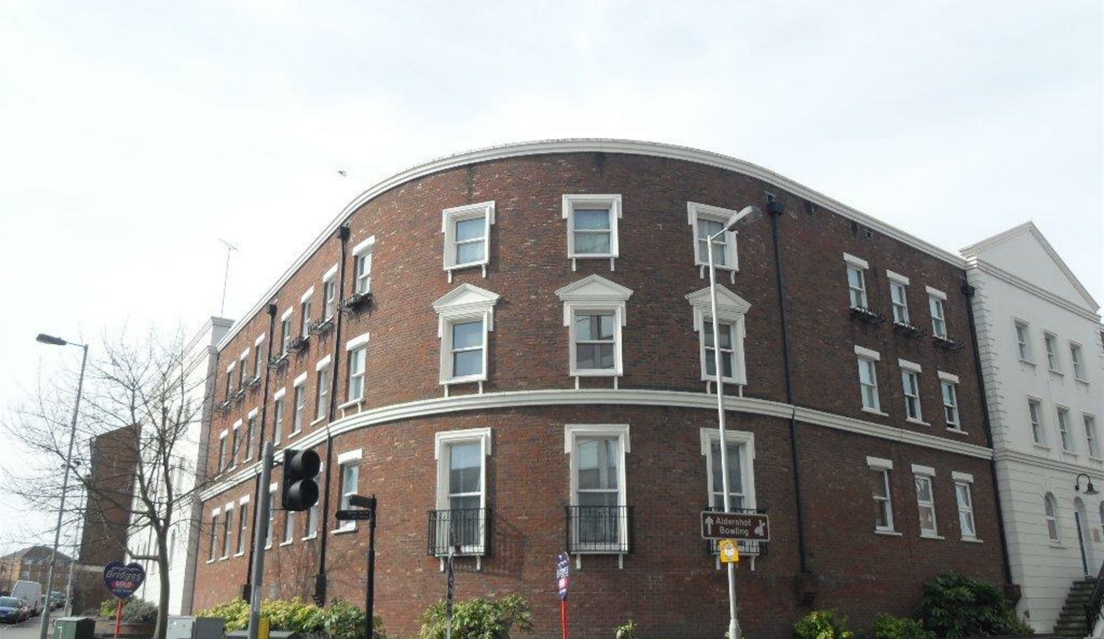
Stratfield House, Birchett Road