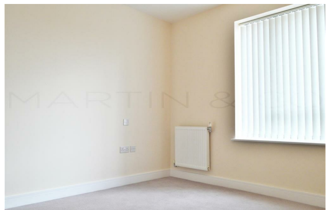
The Peninsula, Pegasus Way, Gillingham