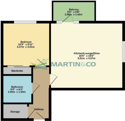
TOTAL FLOOR AREA - 481 sq.ft. (44.7 sq.m.) approx. Made with Metapex 0205

Ground Floor 481 sq.ft. (44.7 sq.m.) approx.