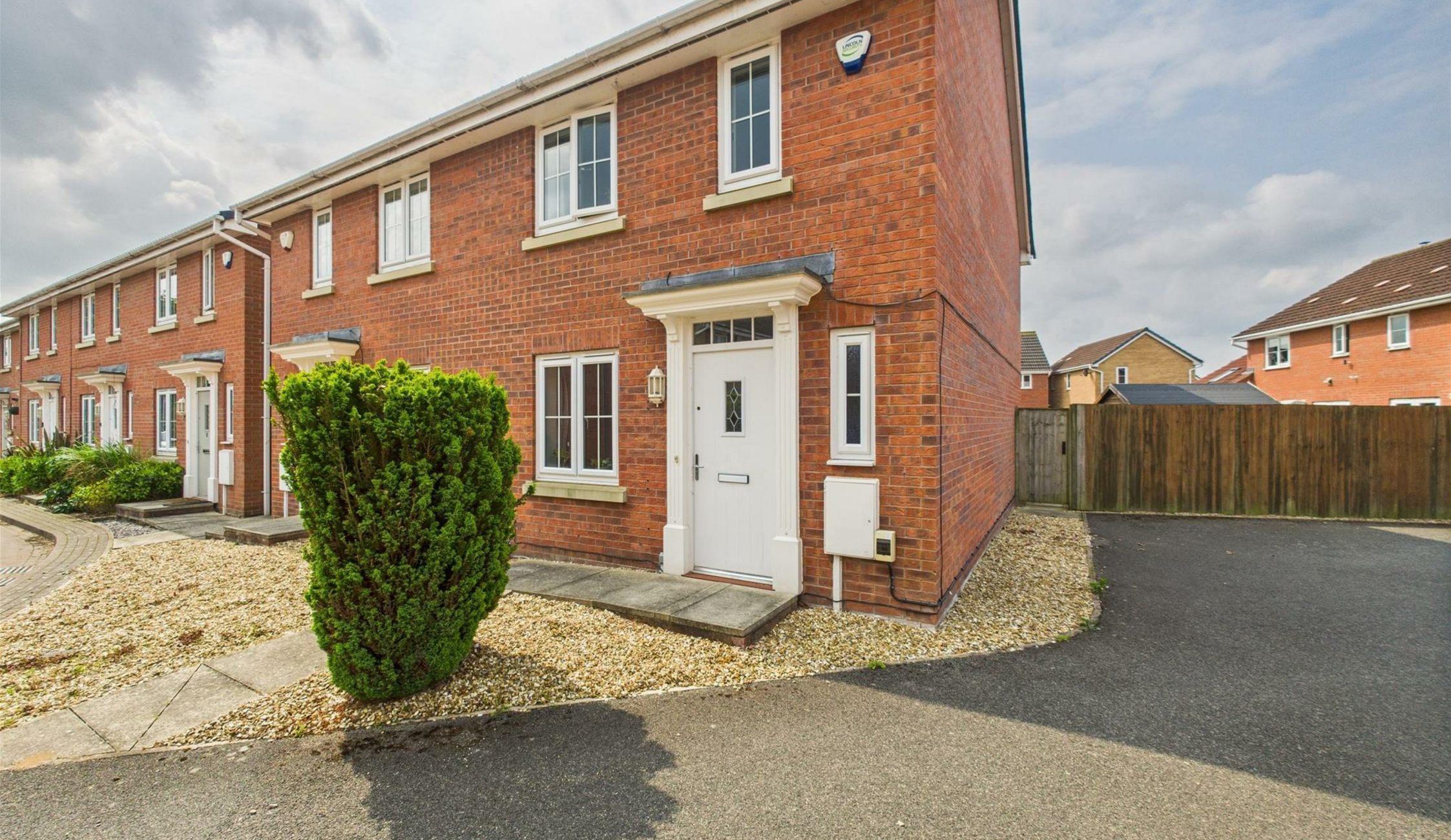
Magnus Court, North Hykeham, Lincoln