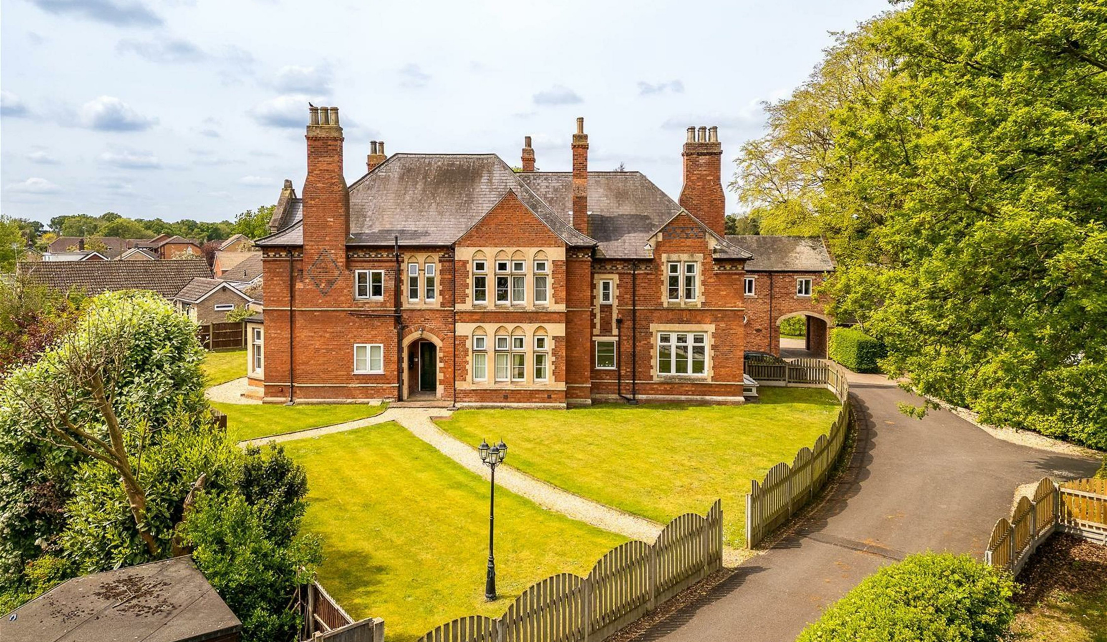
Old Vicarage Gardens, Skellingthorpe, Lincoln