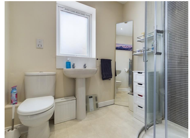
FIGURE & FITTINGS Please Note : Items described in these particulars are included in the sale, all other items are specifically excluded. We cannot verify that they are in working order, or fit for their purpose. The buyer is advised to obtain verification from their solicitor or surveyor. Measurements shown in these particulars are approximate and as room guides only. They must not be relied upon or taken as accurate. Purchasers must satisfy themselves in this respect.

OUTSIDE SPACE To the front is an allocated parking space, small gravel area, pathway, and bin shed. The rear boasts a private south facing landscaped garden, fully enclosed with gated access, artificial grass, decking, patio and a shed included in sale.