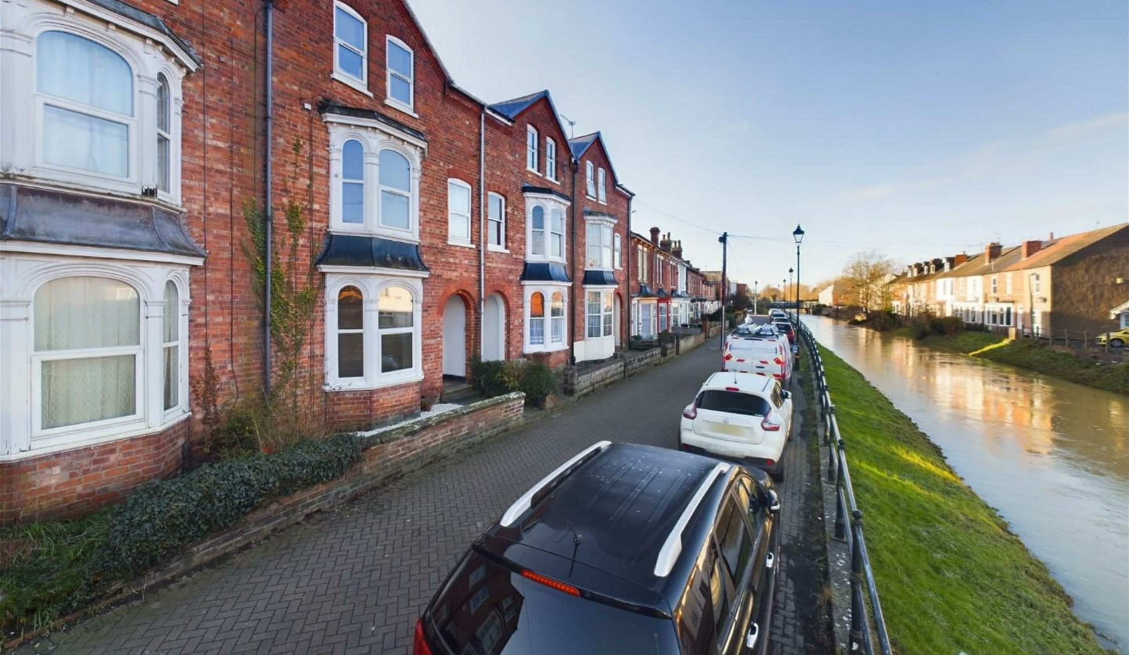
Altham Terrace, Lincoln