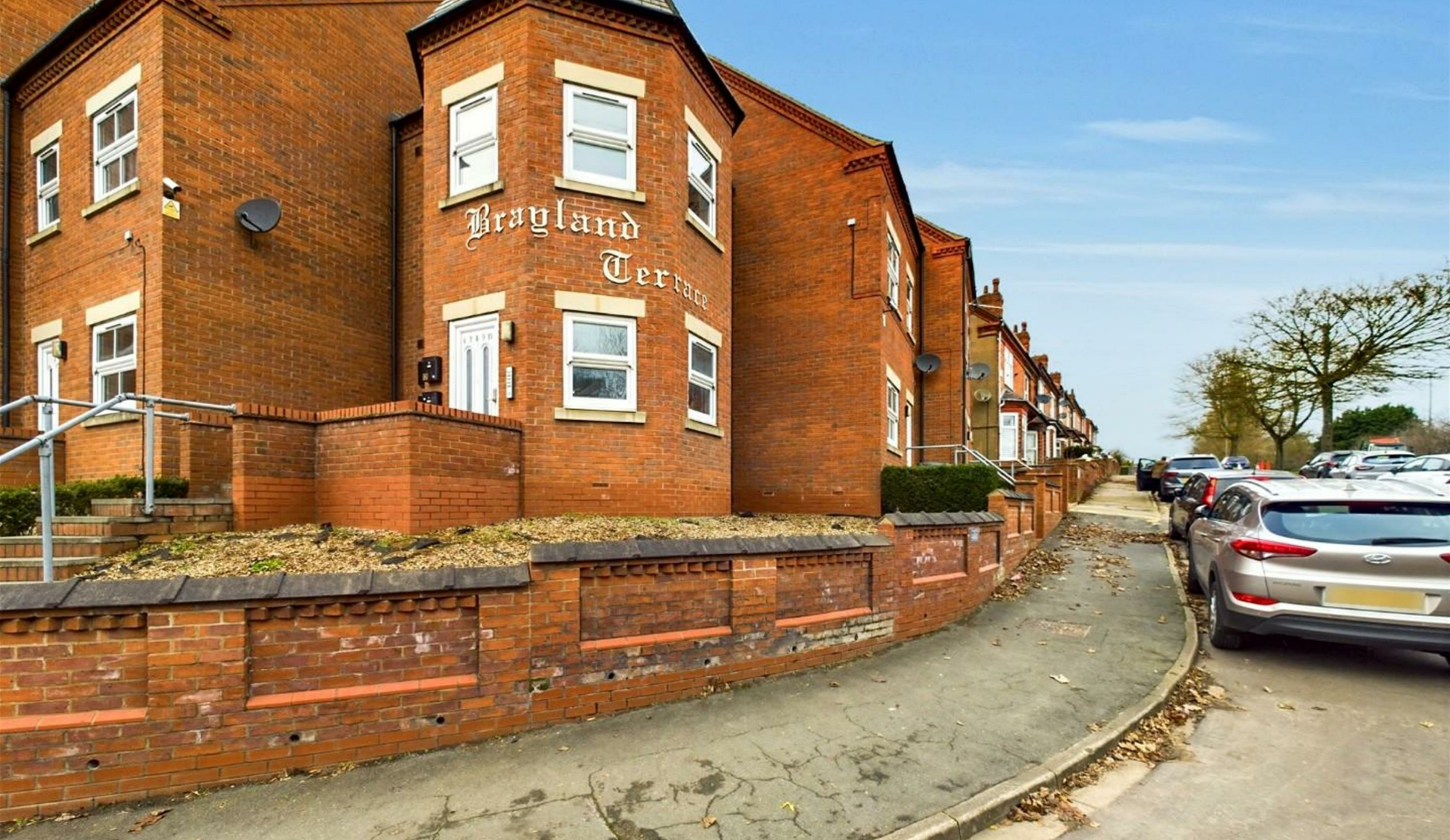
Brayland Terrace, Monks Road, Lincoln