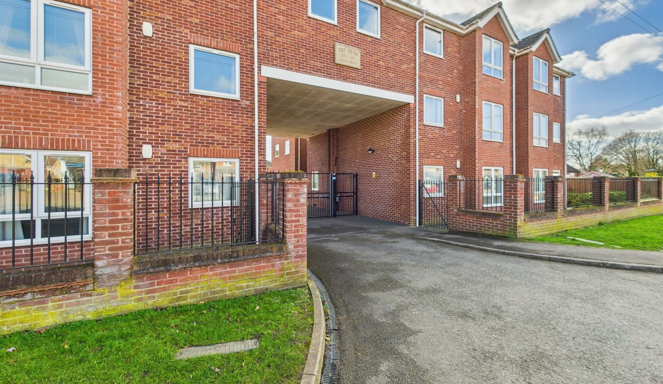
The Mews, Lincoln Road, North Hykeham