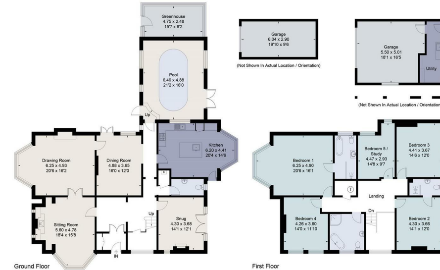
Ground Floor First Floor This floor plan has been drawn in accordance with RICS Property Measurement 2nd edition. All measurements, including the floor area, are approximate and for illustrative purposes only. @fourwalls-group.com #70013