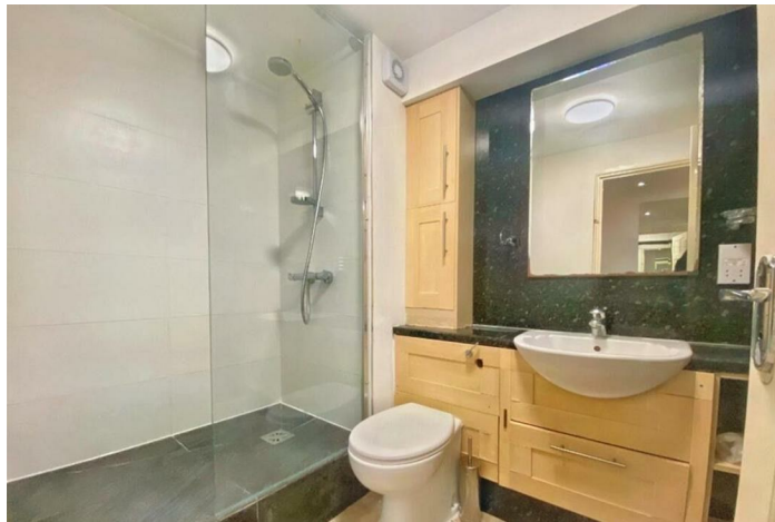
HOUSE - TERRACED (EPC RATING: C)