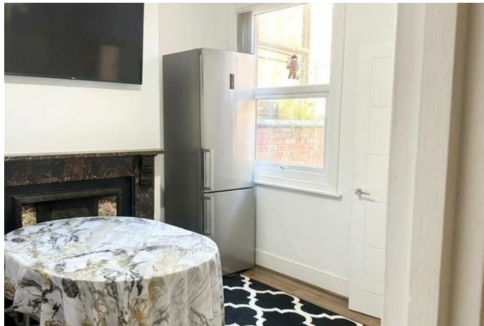
HOUSE - TERRACED (EPC RATING: E)