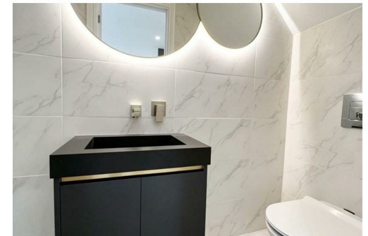
HOUSE - END TERRACE (EPC RATING: B)