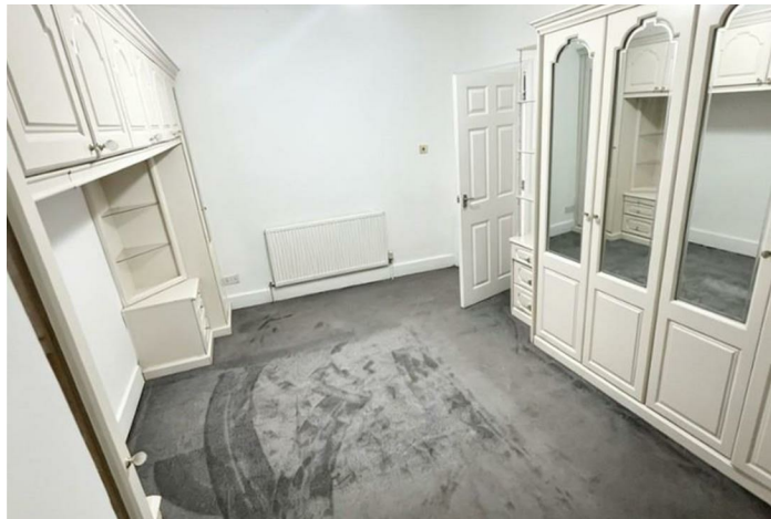
HOUSE - TERRACED (EPC RATING: C)