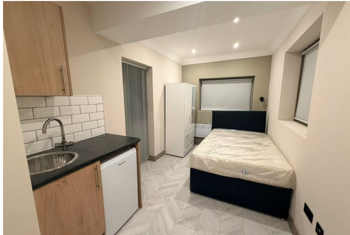
HOUSE - SEMI-DETACHED (EPC RATING: E)