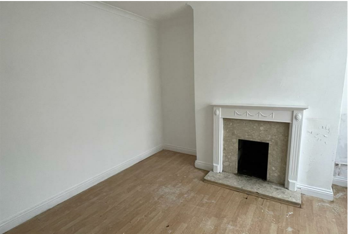
HOUSE - TERRACED (EPC RATING: D)