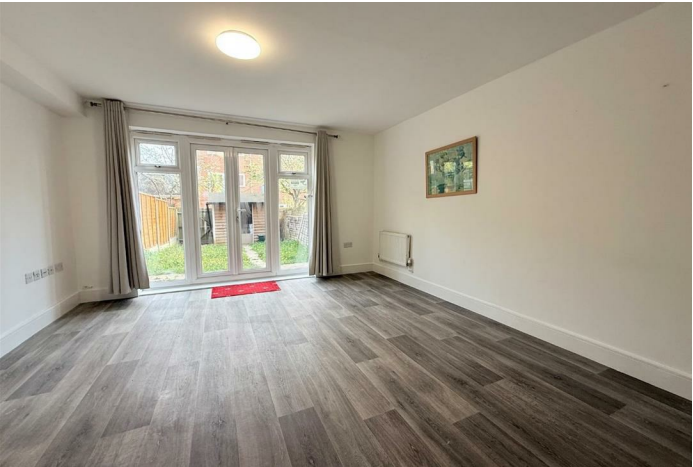
HOUSE - TERRACED (EPC RATING: C)