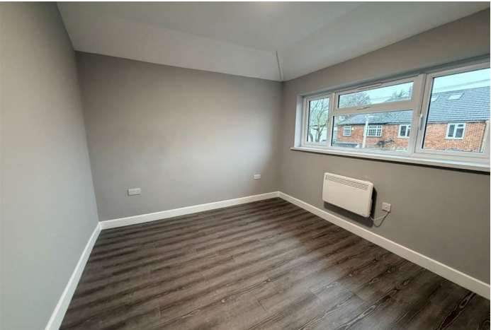
HOUSE - DETACHED (EPC RATING: D)