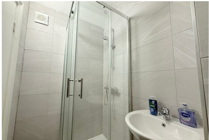
STUDIO (EPC RATING: C)