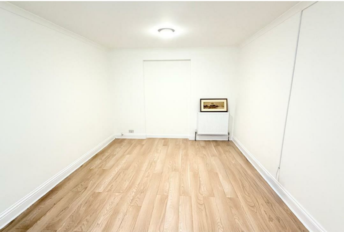
HOUSE - SEMI-DETACHED (EPC RATING: D)