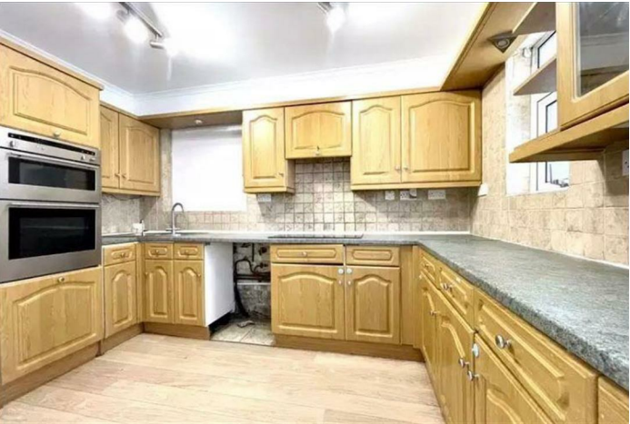
HOUSE - SEMI-DETACHED (EPC RATING: D)