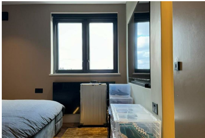
APARTMENT (EPC RATING: D)

FLAT 29 STEEPLE CHASE COURT, NORTHOLT, UB5 4FG PER MONTH