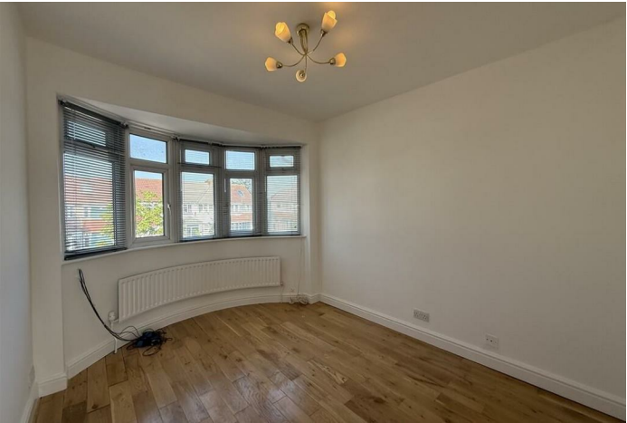
HOUSE - END TERRACE (EPC RATING: D)