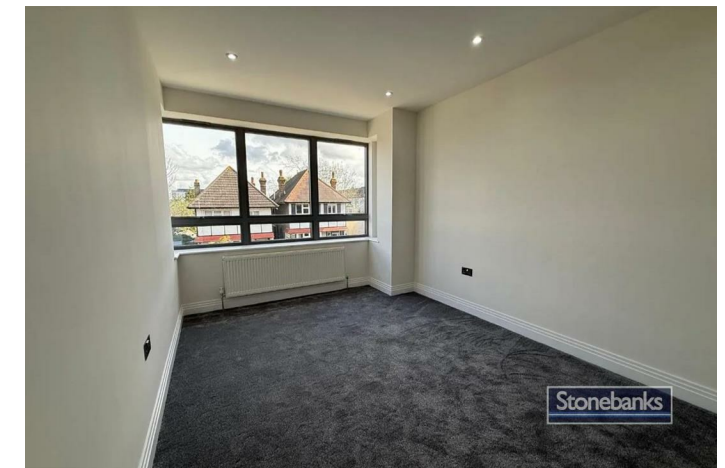
HOUSE - TERRACED (EPC RATING: D)