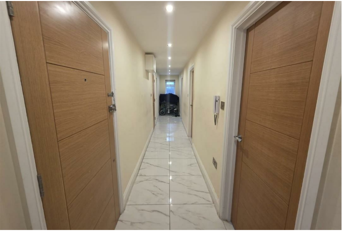
BLOCK OF FLATS (EPC RATING: )