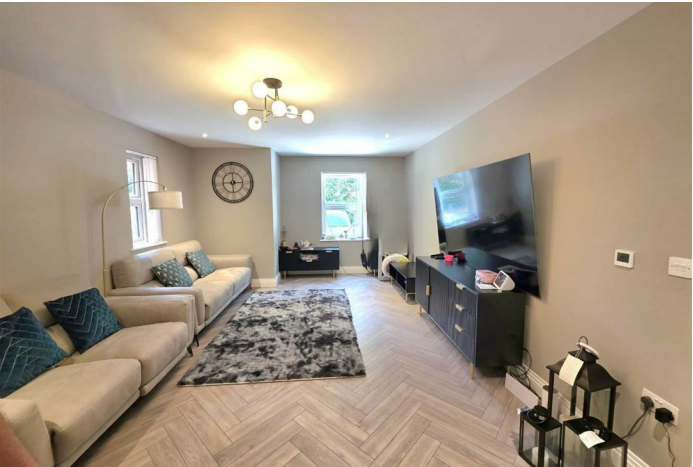
HOUSE - DETACHED (EPC RATING: B)