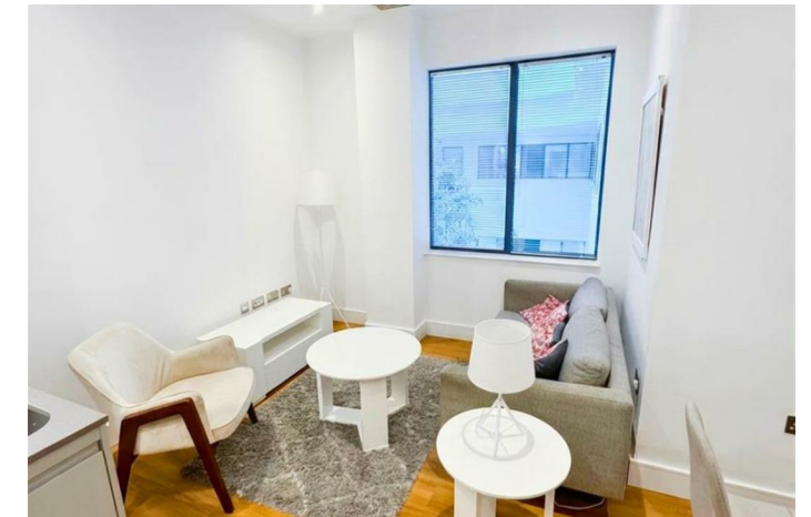
APARTMENT (EPC RATING: D)