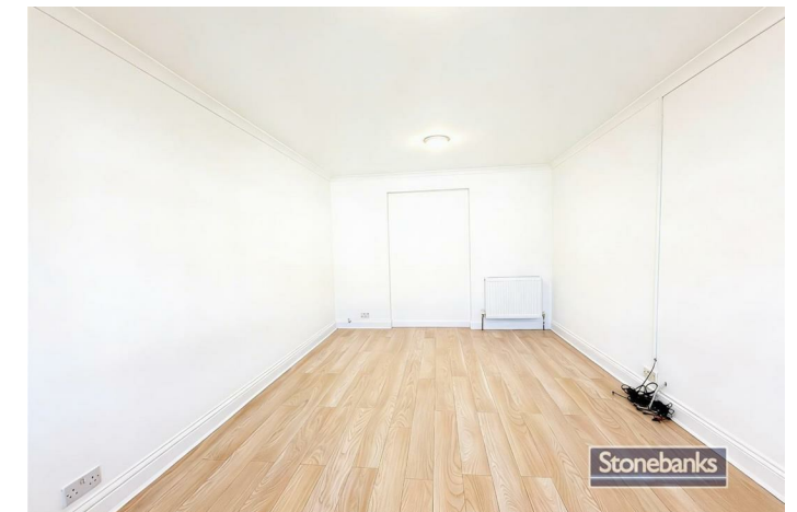
HOUSE - SEMI-DETACHED (EPC RATING: D)