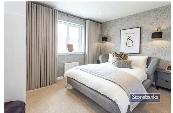
HOUSE - SEMI-DETACHED (EPC RATING: D)