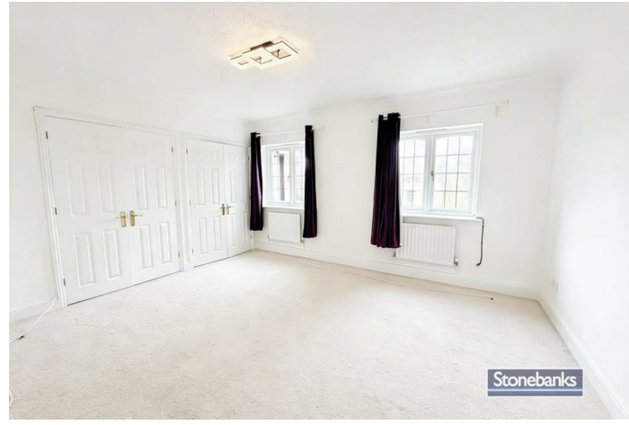
HOUSE - DETACHED (EPC RATING: C)