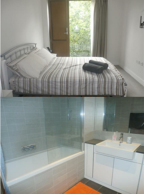
61, Parkside Place, Parkside, Cambridge, CB1 1HS