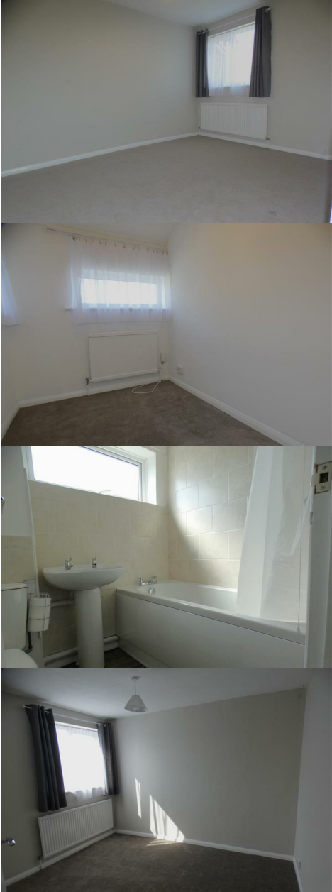
Pheasant Rise, Bar Hill, CB23 8SA