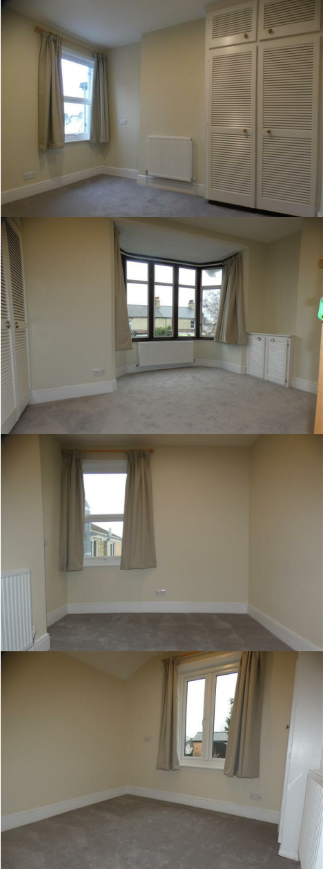
Cherry Hinton Road, Cambridge, CB1 7AW

These particulars, whilst believed to be accurate are set out as a general outline only for guidance and do not constitute any part of an offer or contract. Intending tenants should not rely on them as statements of representation of fact, but must satisfy themselves by inspection or otherwise as to their accuracy. No person in this firms employment has the authority to make or give any representation or warranty in respect of the property.