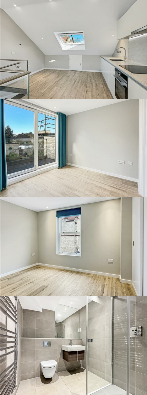
Ground Floor Approx. 34.4 sq. metres (370.5 sq. feet)