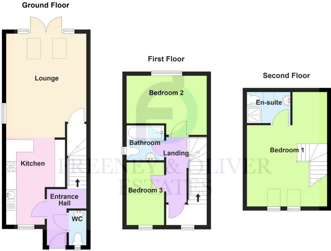
3 Nixon Phillips Drive, Hindley Green