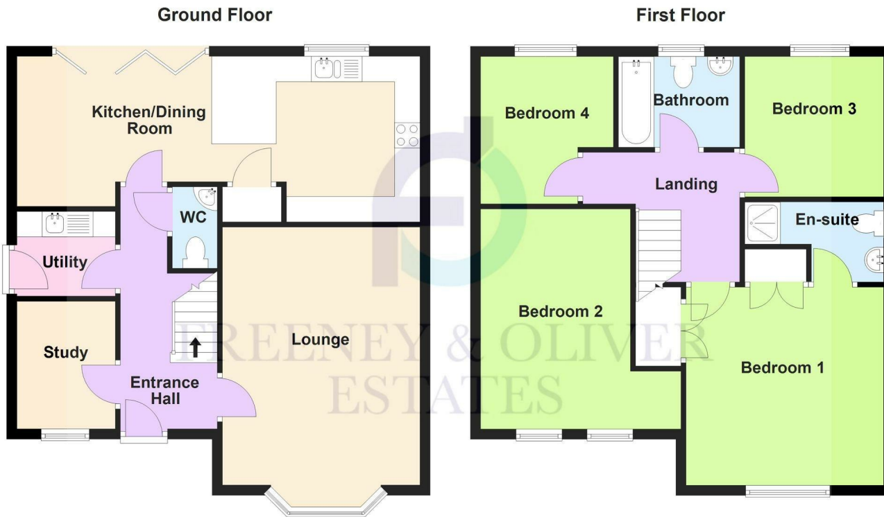
7 Moss Green Close, Standish