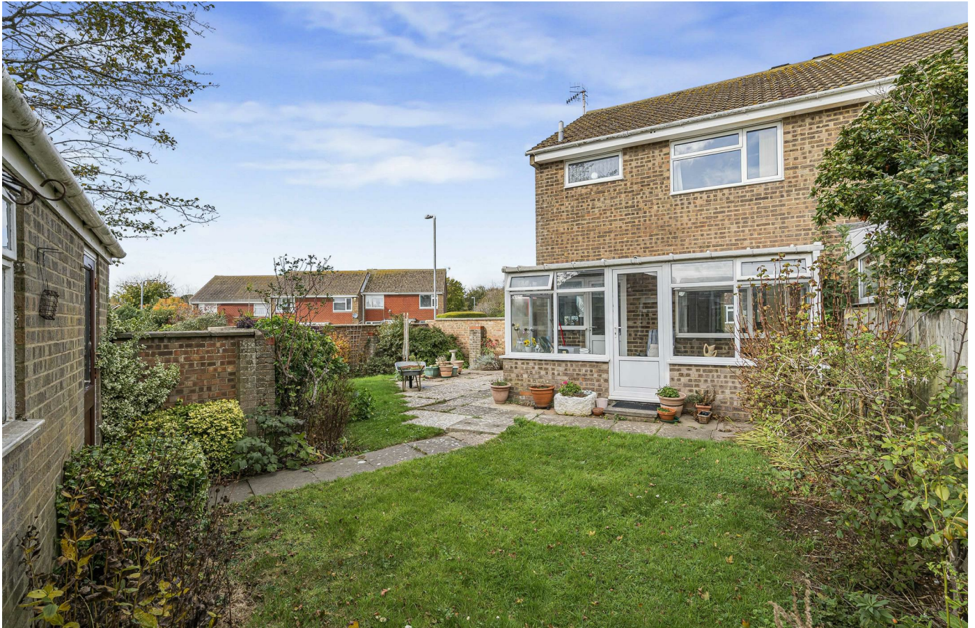
36 Belvedere Gardens, Seaford, BN25 3BQ