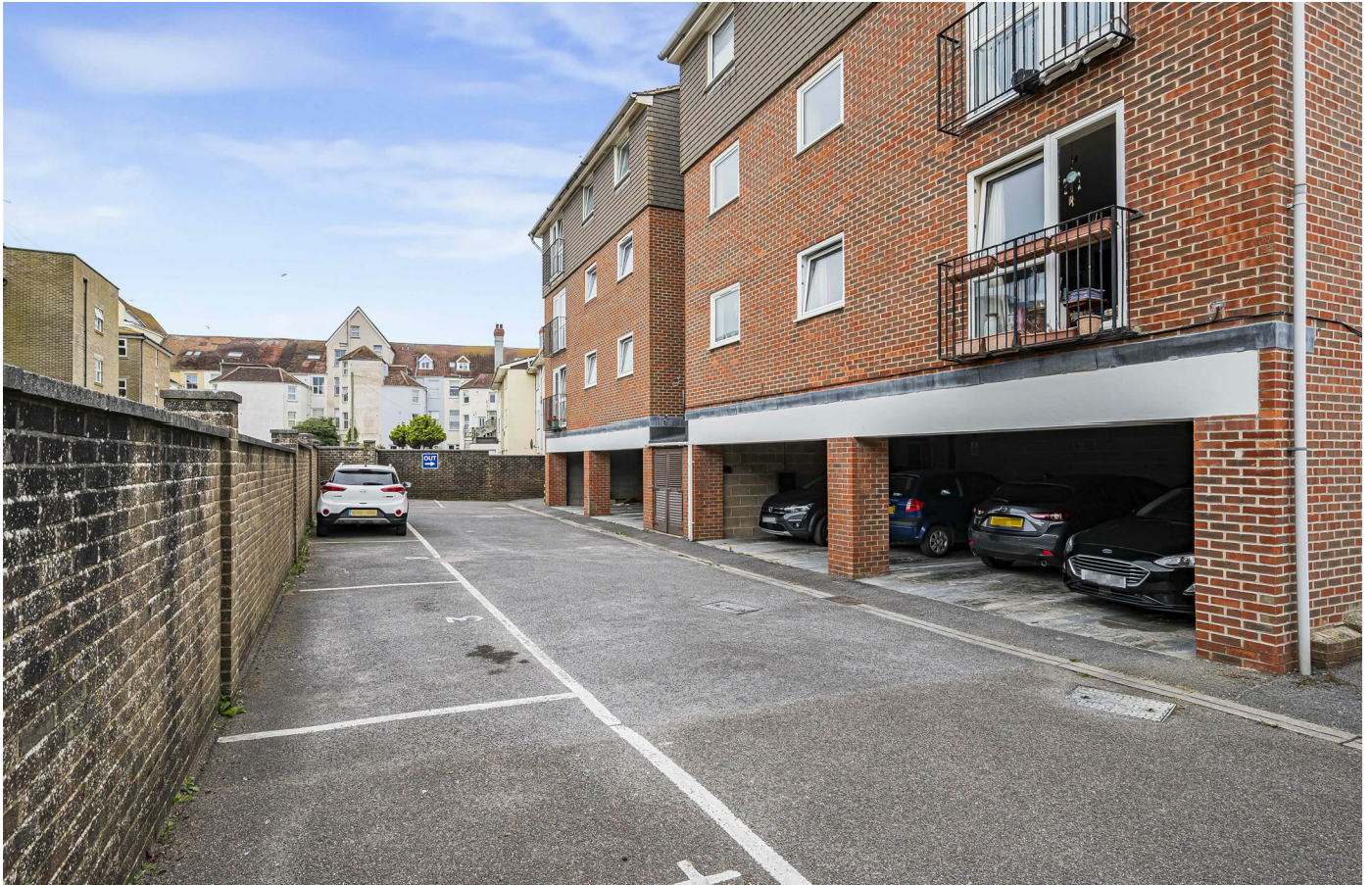
Flat 7 Rayford Court St. Johns Road, Seaford, BN25 1JW