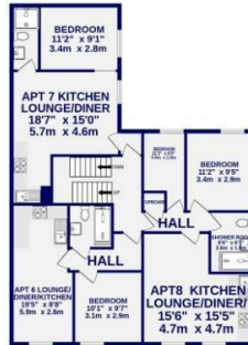
3RD FLOOR 826 sq.ft. (76.8 sq.m.) approx.