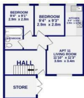
GROUND FLOOR 1889 sq.ft. (175.5 sq.m.) approx.