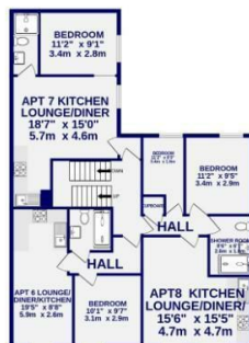
3RD FLOOR 826 sq.ft. (76.8 sq.m.) approx.