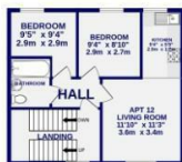
1ST FLOOR 1724 sq.ft. (160.1 sq.m.) approx.