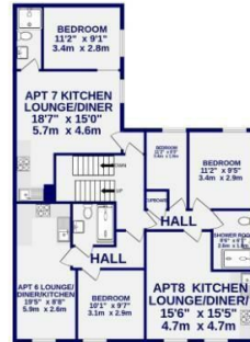
3RD FLOOR 826 sq.ft. (76.8 sq.m.) approx.