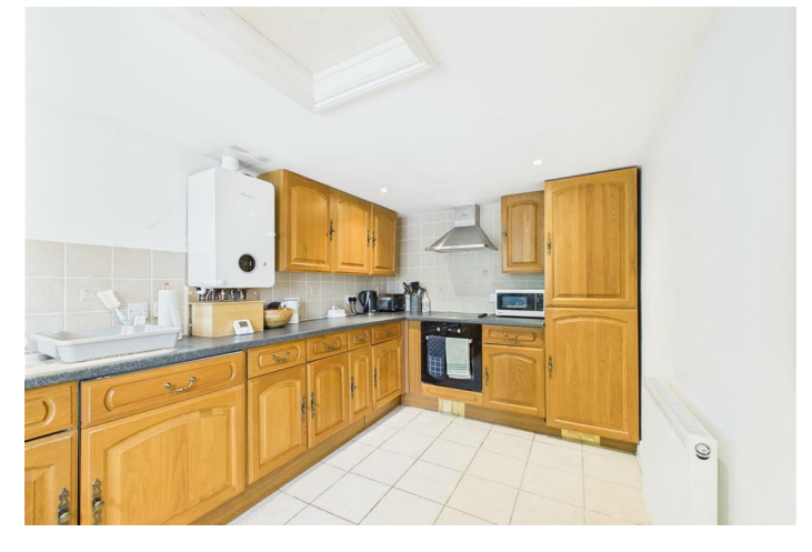
Bungalow - Detached (EPC Rating: C)

THE OLD BARN, CHESTERTON LANE, CIRENCESTER, GLOUCESTERSHIRE, GL7 PCM