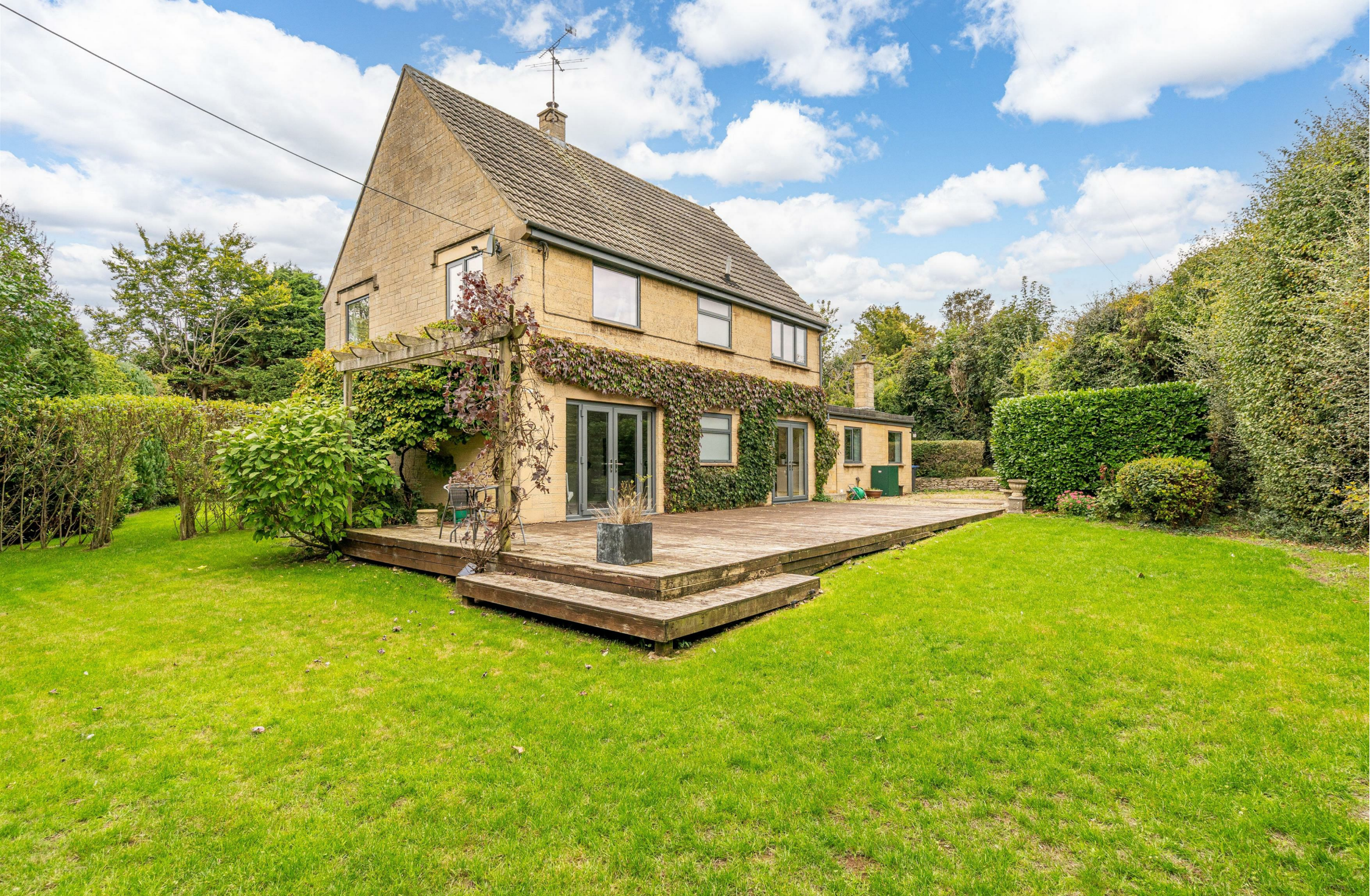
Showing the rear garden and decking with access from the living room and kitchen patio doors