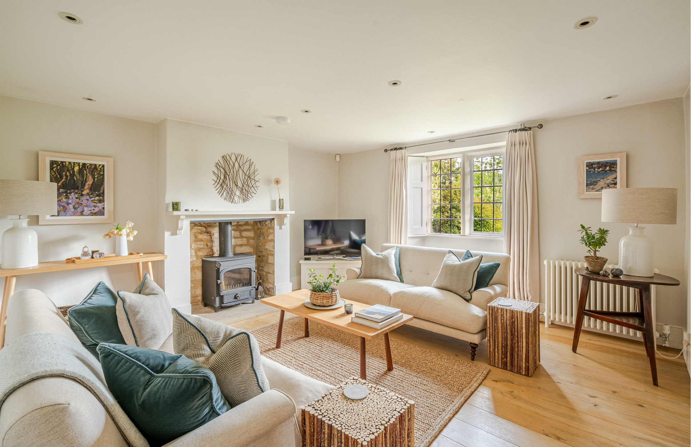
West Cottage - Living Room